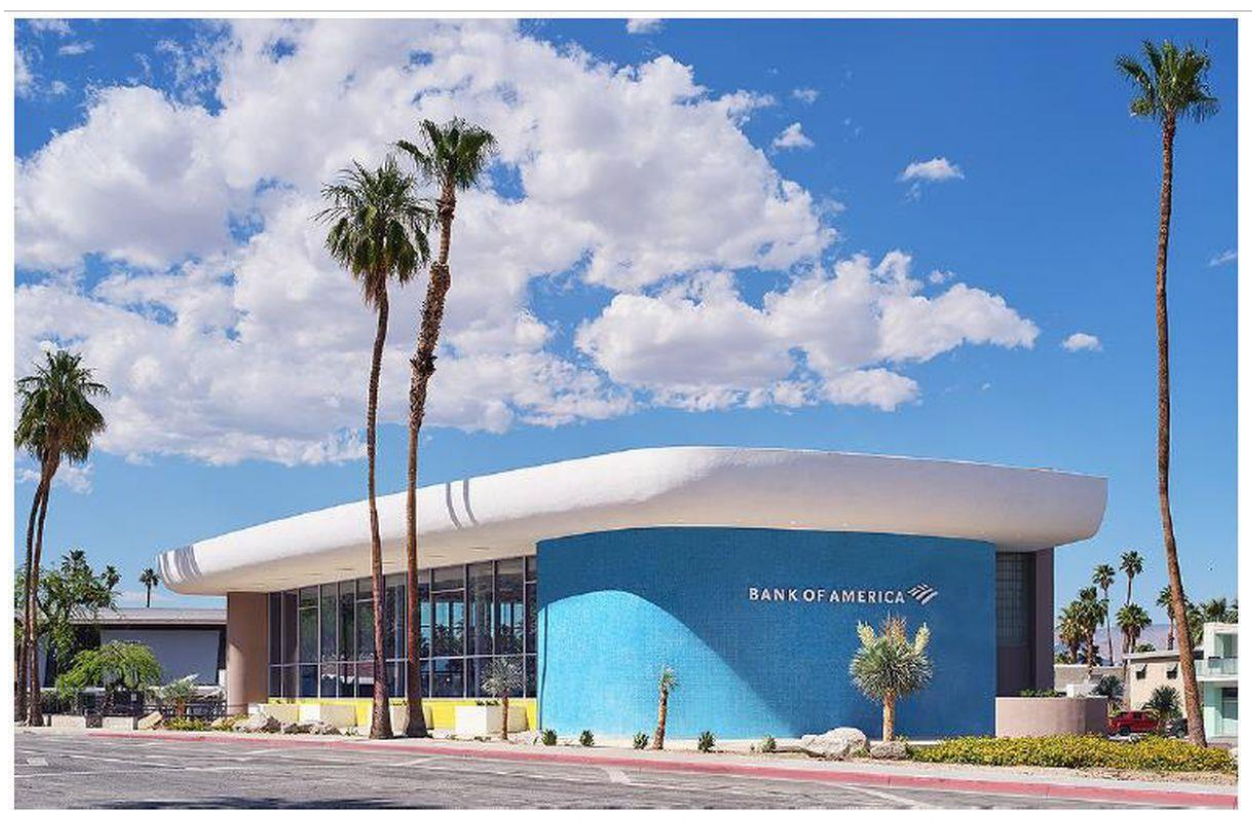
Midcentury Modern Renovation Project to be honored by Palm Springs Modern Committee in the Fall