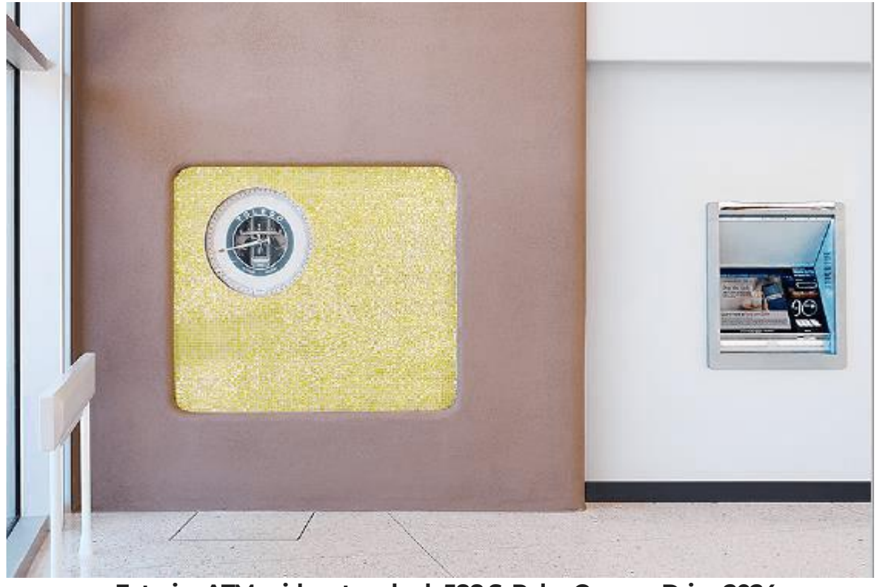
Exterior ATM midcentury look 588 S. Palm Canyon Drive 2024