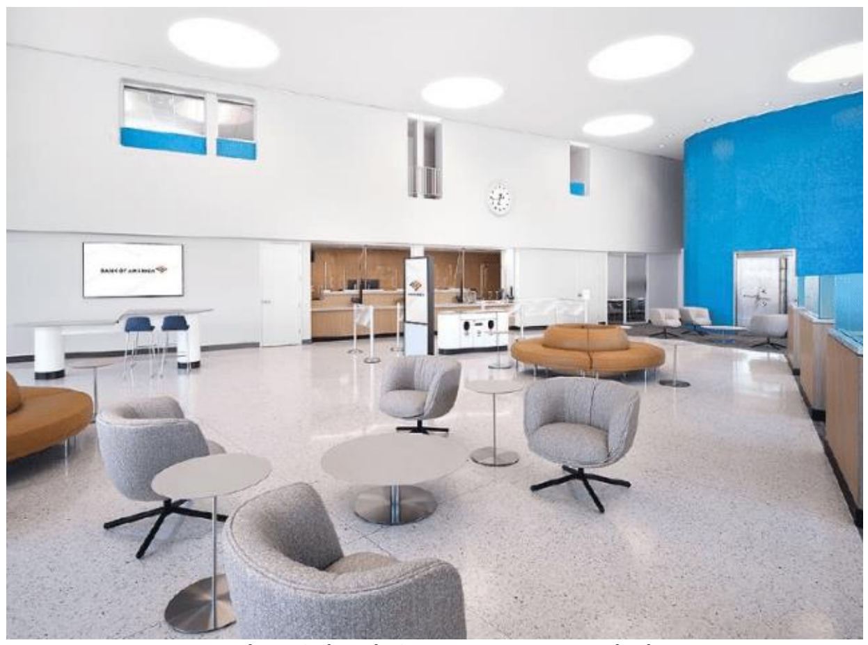
Restoration of historic floor scale and mosaic tilework 588 S. Palm Canyon Drive 2024