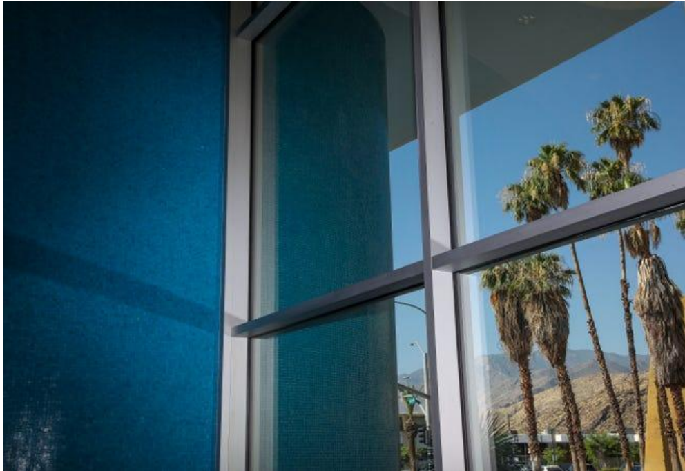
The interior of the Bank of America building designed by architect Rudy Baumfield in Palm Springs, Calif., June 14, 2024.

The building's architecture fits in perfectly with Palm Springs iconic architecture. Drivers are likely to notice the sky-blue tiles on the exterior of the building, while the smooth cloudlike roof seems to hover above the walls. Stepping inside is like taking a trip back to the 1950s. The bright interior is lit by a large wall of windows, with custom-designed furniture meant to evoke a bygone era.