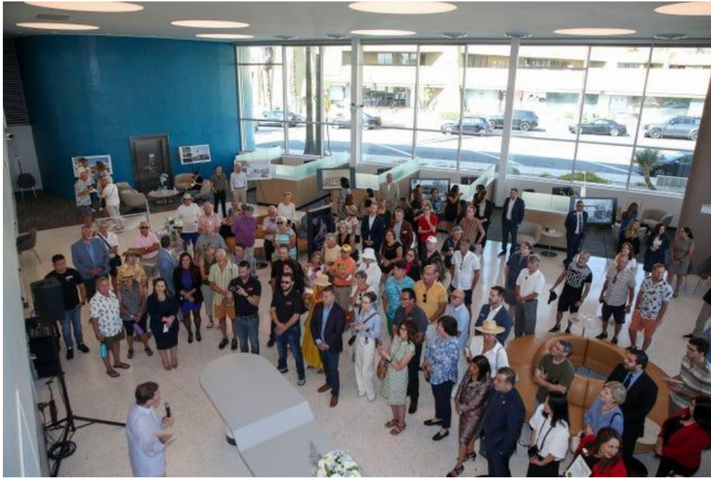
People attend the Bank of America reopening after it had been closed for a renovation in Palm Springs, Calif., June 14, 2024.

The city of Palm Springs designated the site a Class One Historic Site in 2007.