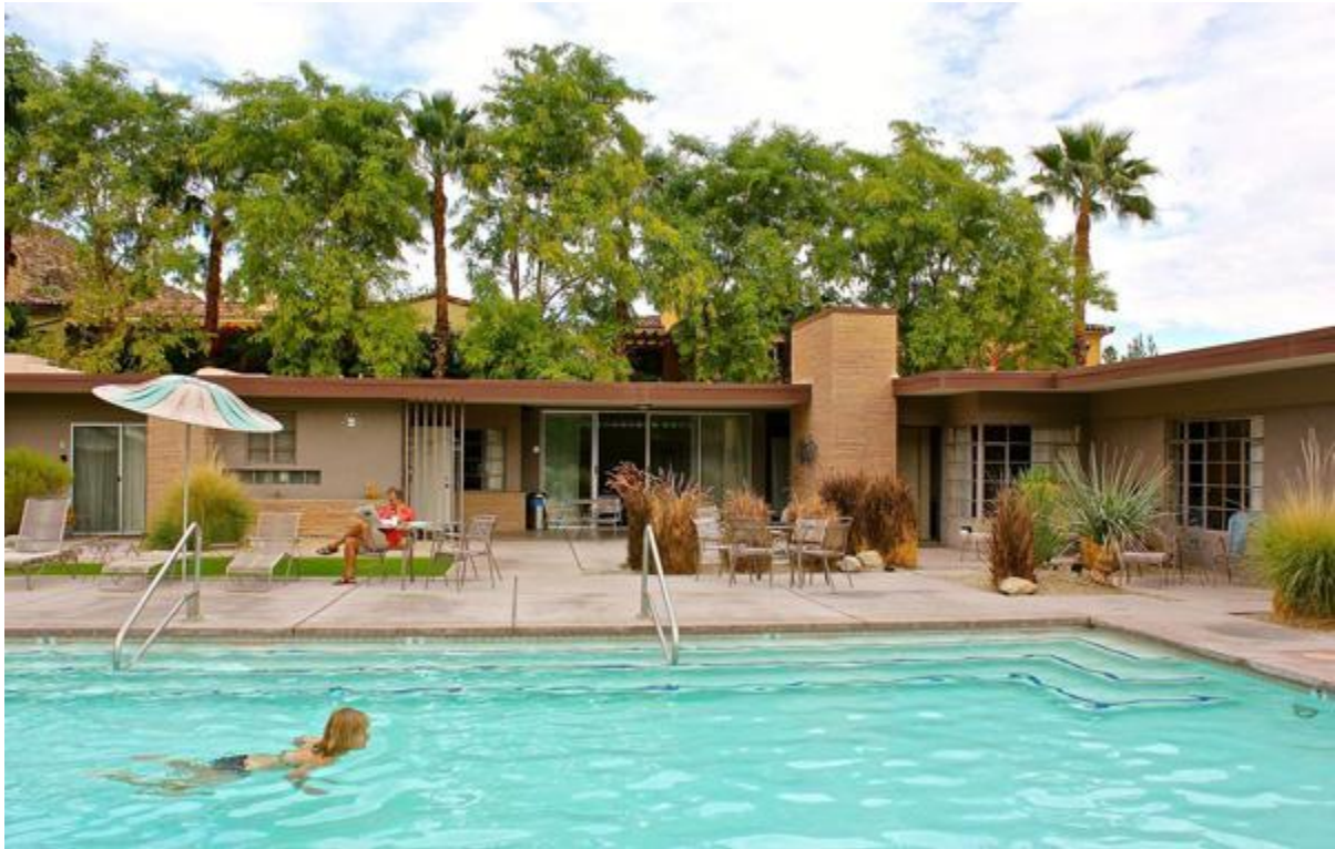
The Hideaway, formerly the Town and Desert Apartments.