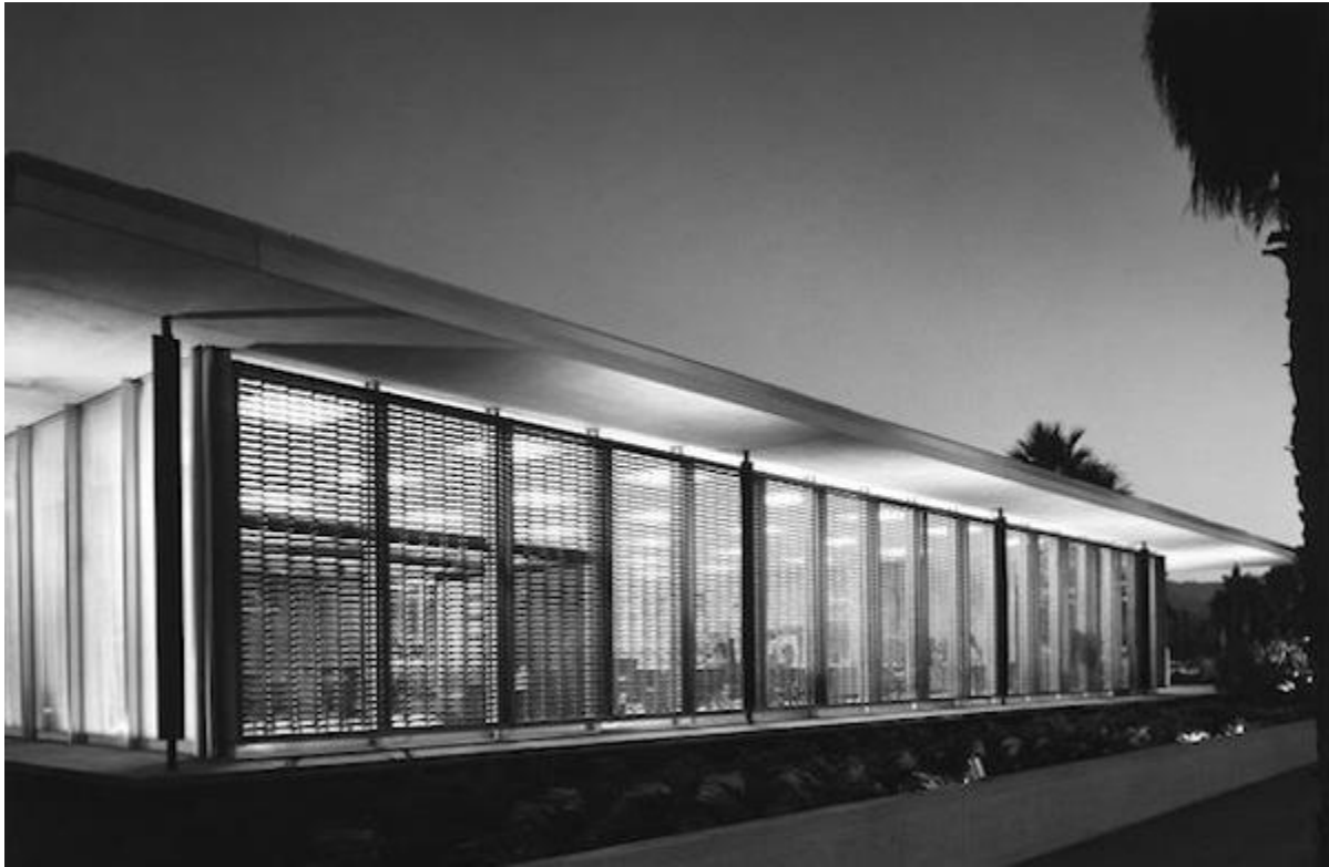
The Santa Fe Savings and Loan is now the Palm Springs Art Museum's Architecture & Design Center.