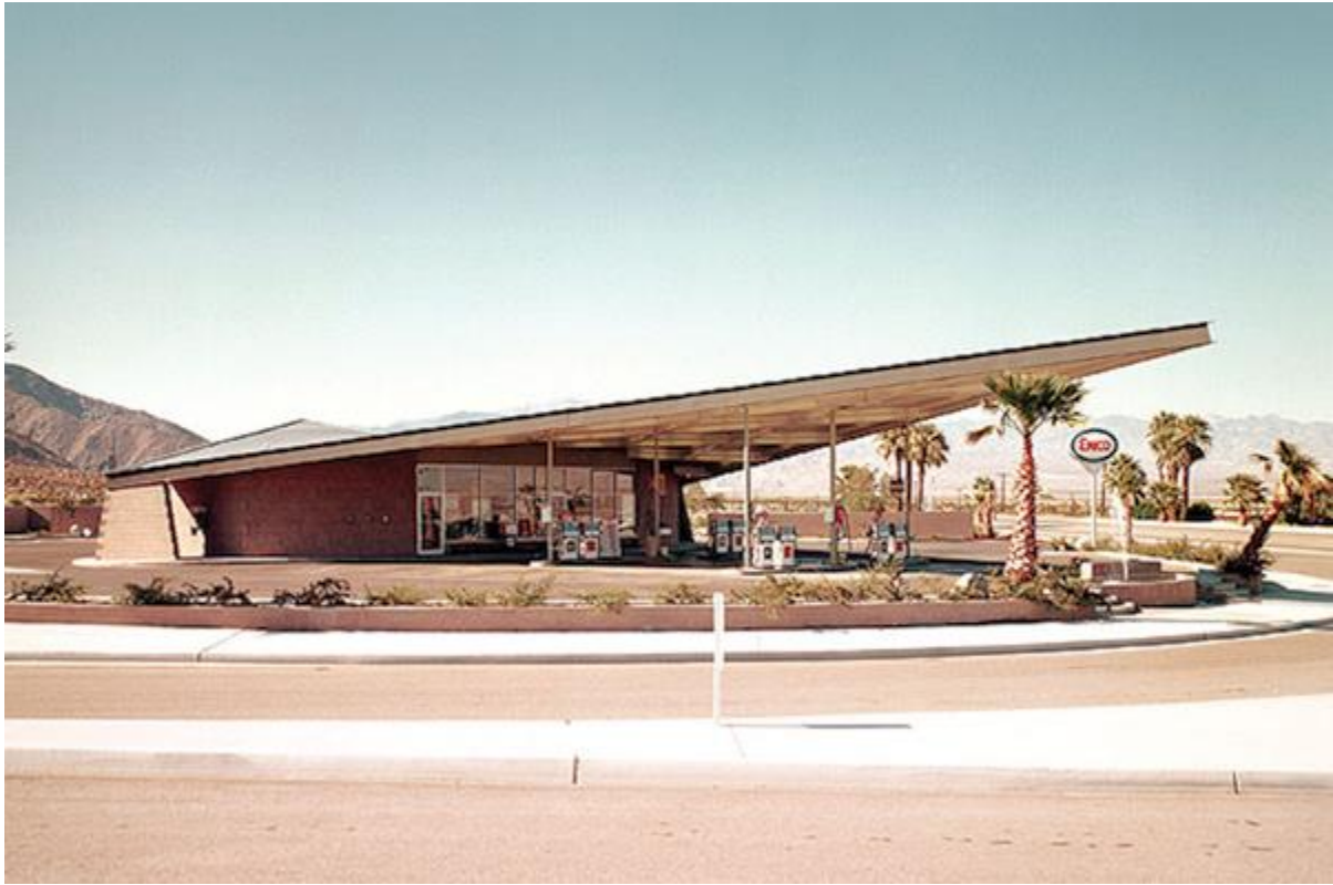
The Tramway Gas Station is now the Palm Springs Visitors Center.

Due to the HSPB and other local preservation organizations, Palm Springs has retained much of its important Spanish Colonial Revival and Midcentury Modern architecture. Two high profile examples of architectural preservation through Class 1 historic designation are the Tramway Gas Station and the Santa Fe Federal Savings and Loan.