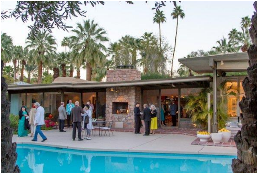
A more recent photo showing the home with its swimming pool and fire pit.

Modernism guests will have an opportunity to tour the property, not to mention the tennis pavilion where Kirk Douglas papered the walls with colorful (now vintage) movie posters from his long and distinguished career in which he received three Oscar nominations ( Champion , The Bad and the Beautiful , and Lust for Life ), an honorary Oscar for Lifetime Achievement, and the Presidential Medal of Freedom.