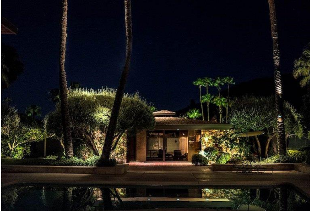
The Kirk Douglas home on Via Lola in the Old Las Palmas neighborhood of Palm Springs.